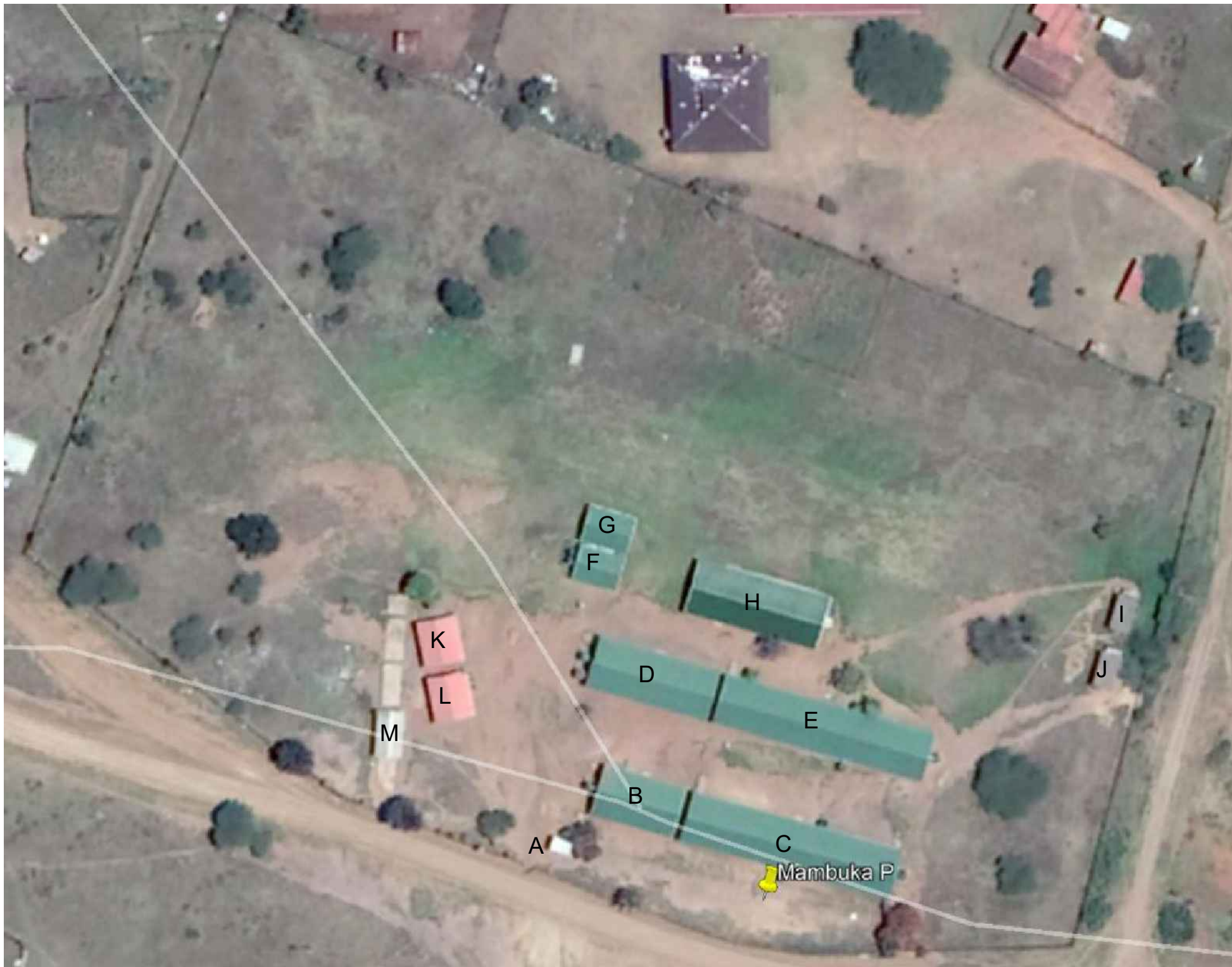
LOCALITY PLAN NTS